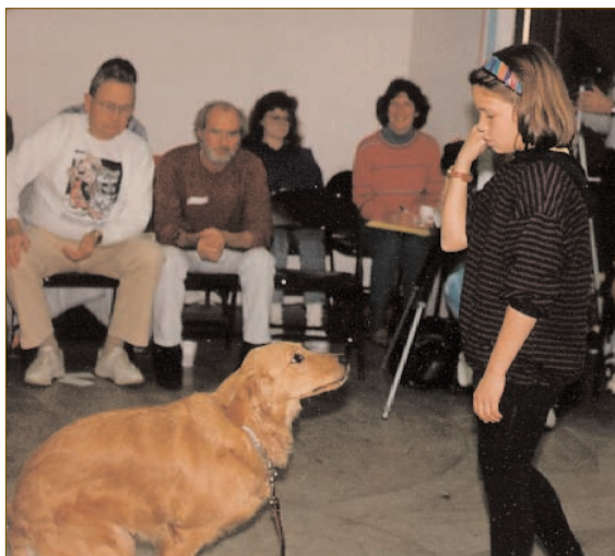
By coming when called and sitting on request, a puppy demonstrates willing compliance and shows respect to his trainer—a child.

Give children tasty treats such as freeze-dried liver as well as kibble to use as lures and rewards during handling and